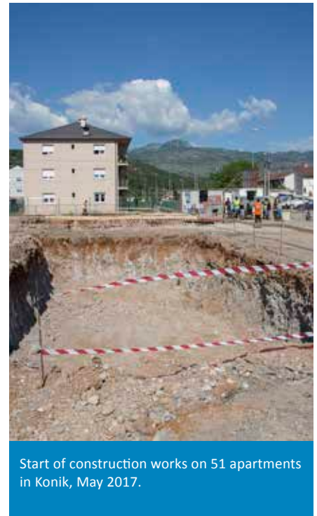
Start of construction works on 51 apartments in Konik, May 2017.